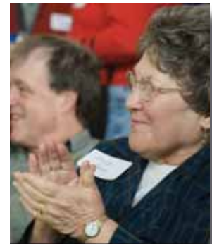
A 2008 Summer Fundraiser attendee

Thank you to everyone who recently supported AYEa as volunteers and peer leaders!