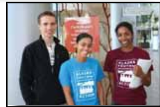
Anchorage AYEА youth promoting the Renewable Energy campaign at the Business of Clean Energy in Alaska conference