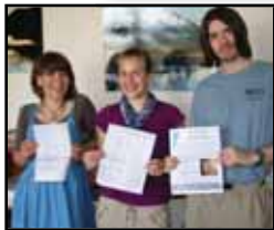
The Palmer AYEА Chapter presented about Sustainable Schools to the Mat-Su School District, May 2009