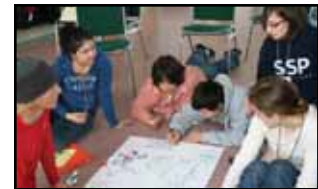
Participants brainstorm at the Civics & Conservation Summit 2009

AYEА MISSION: TO INSPIRE, EDUCATE AND TAKE ACTION ON ENVIRONMENTAL ISSUES FACING OUR COMMUNITIES.