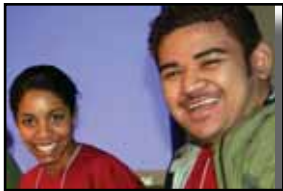
AYEА Youth participate in a panel at the “Get Outdoors Anchorage!” Conference in December 2008