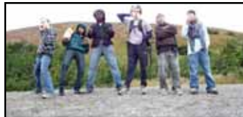
Participants of the 2008 Summer “AYEА Art in Action” Training having fun hiking