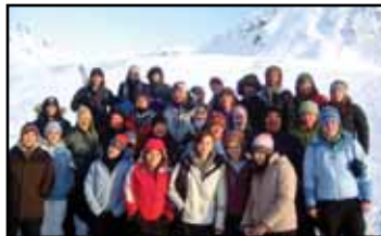
The AYEА Statewide Leadership Retreat Hatcher’s Pass, January 2009