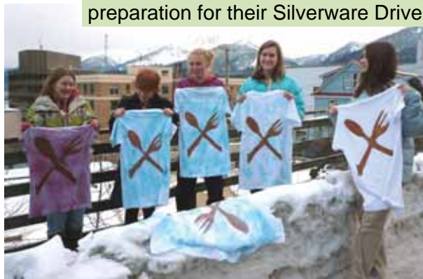
Juneau AYEА teens making t-shirts in preparation for their Silverware Drive!

'Greenware' utensils in various schools. They have been communicating with the representative from "Greenware Alaska" to find these supplies. They hope that entire districts will start using biodegradable utensils.